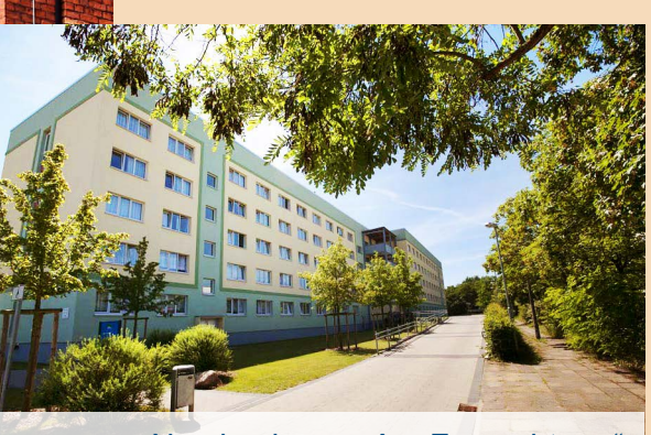
Nursing home "Am Fernsehturm"