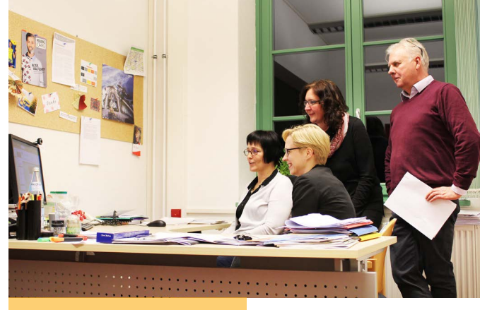
Contact via videocall